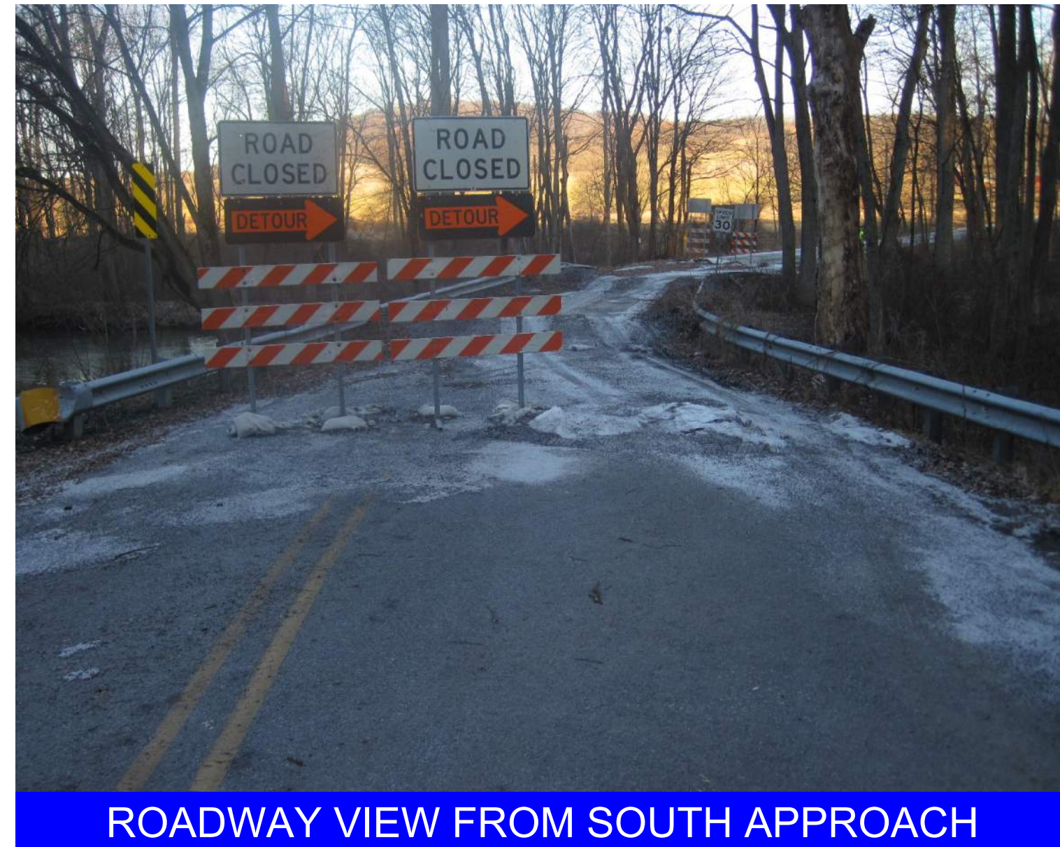
ROADWAY VIEW FROM SOUTH APPROACH