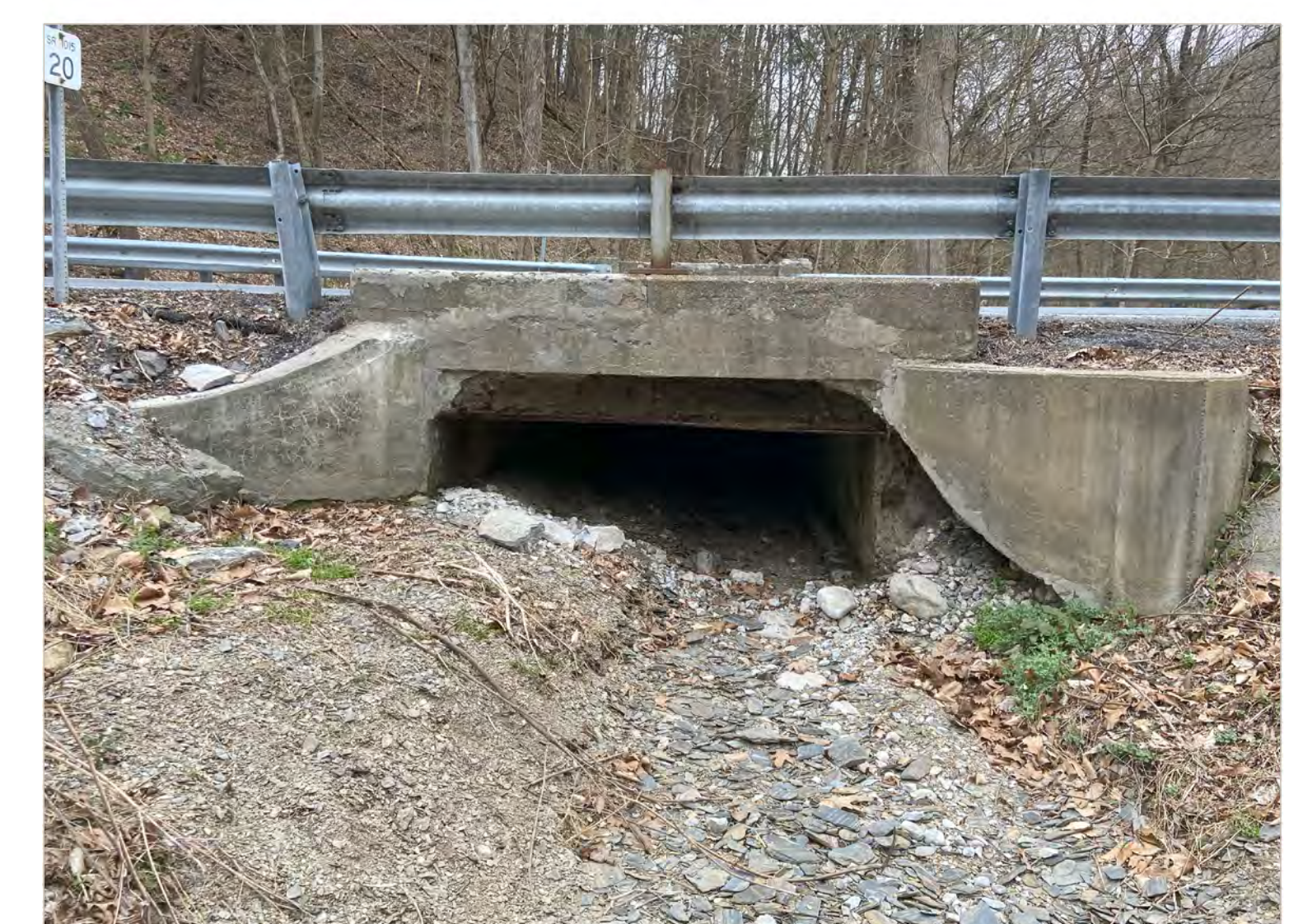
EAST ELEVATION VIEW