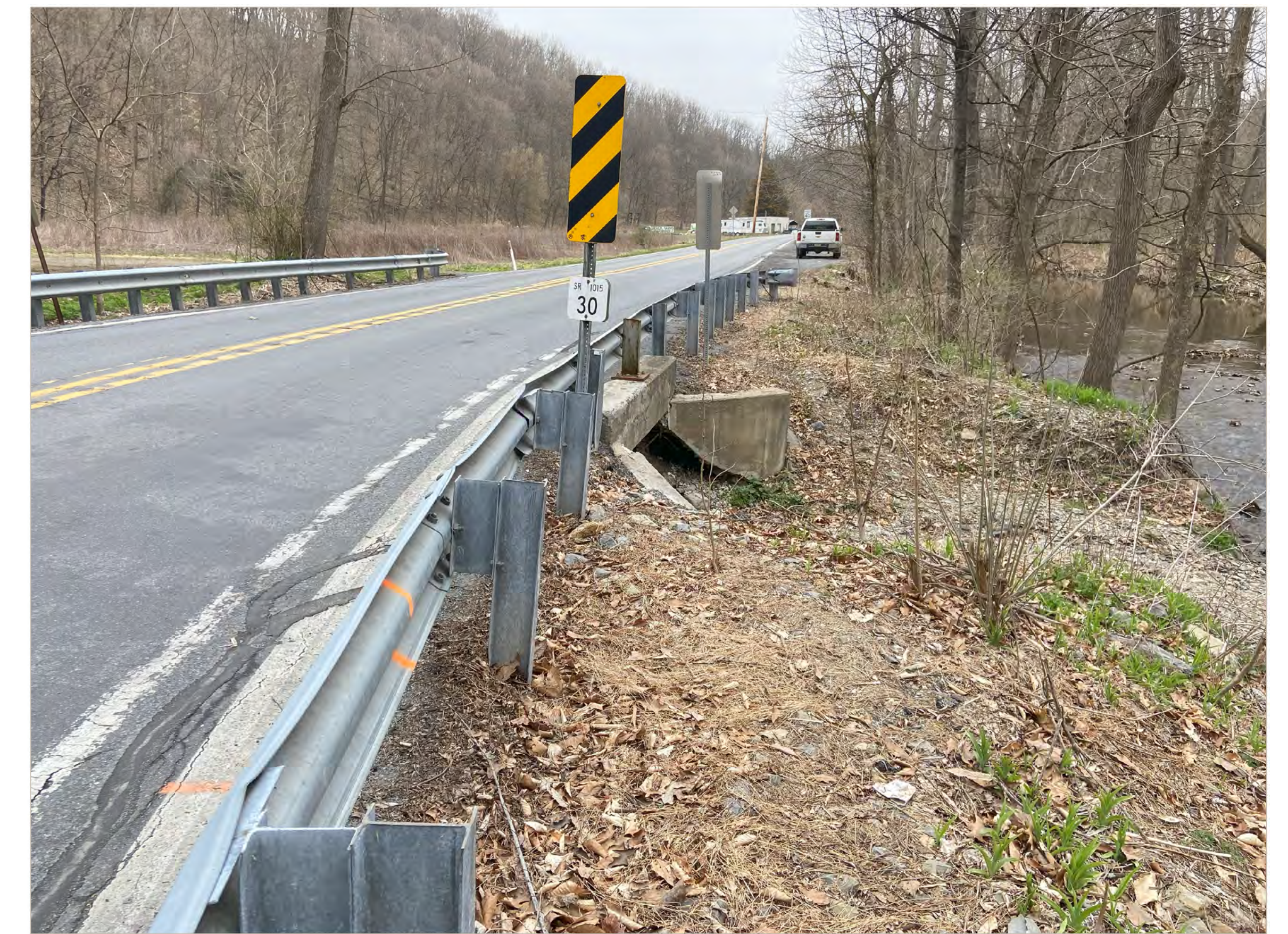
ROADWAY VIEW FROM SOUTH APPROACH