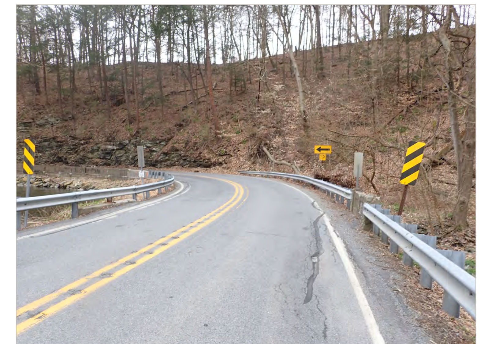
ROADWAY VIEW FROM NORTHERN APPROACH