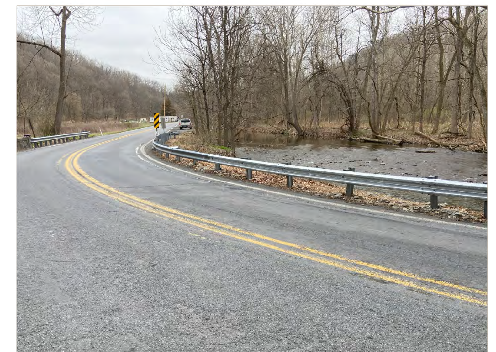
ROADWAY VIEW FROM SOUTHERN APPROACH