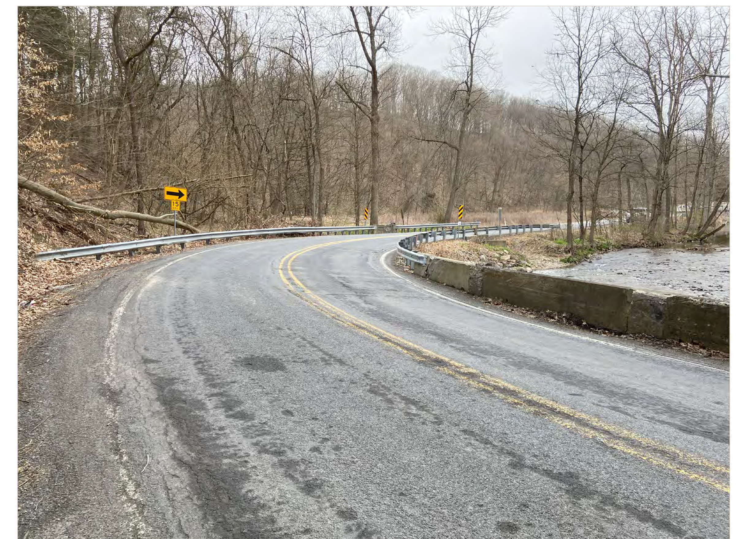
ROADWAY FROM SOUTH APPROACH

*DETOUR MATCHES SR 1015-03B PROJECT, CONSTRUCTION 2023-2024