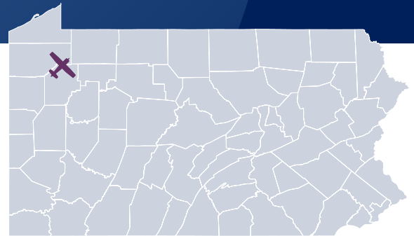
This airport is classified as a Advanced Airport in Pennsylvania's State Aviation System Plan and is eligible to receive federal funding from the FAA.

Titusville Airport (6G1) is a general aviation airport near the City of Titusville, which is close to both the New York and Ohio borders, making it a prime location for regional travelers. The airport prides itself as being an active member of the local community, and local business leaders and government officials volunteer their services at the airport. In a testament to the local community's investment in the airport, a seven-member panel makes recommendations to Titusville's elected officials for all improvement projects. The airport serves the local community by providing support for LifeStar and STAT MedEvac air ambulatory services, which provides emergency air transportation. The airport also provides an Annual Air Show and weekly model airplane flying.